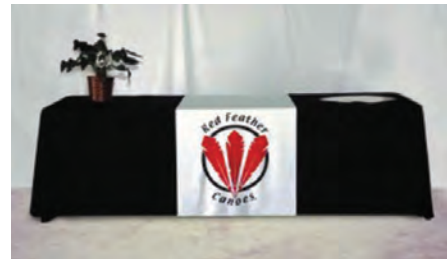
Table Throws And Runners

Personalize your medical facilities, while improving quality of the patient experience with a combination of attractive imagery, custom design elements, and powerful visual information.